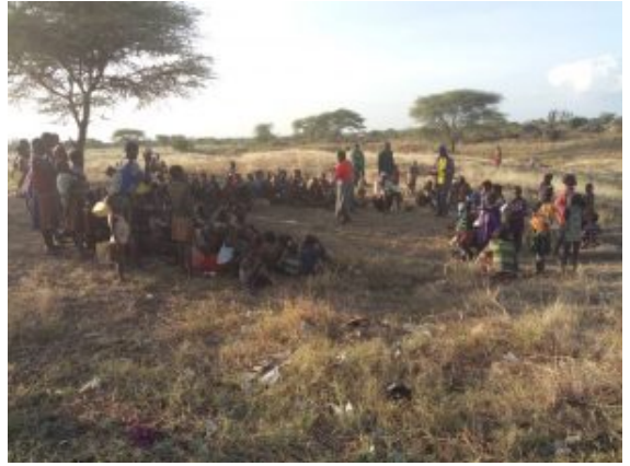
HOLDING - CHURCH - SERVICE - WHEREVER - THEY - CAN