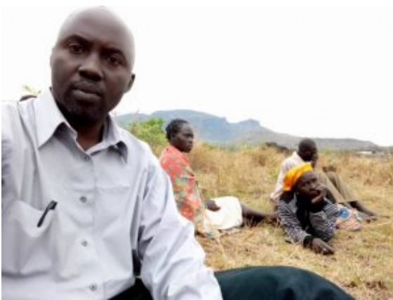
PRAY - SIT - WAIT - UPON - THE - LORD