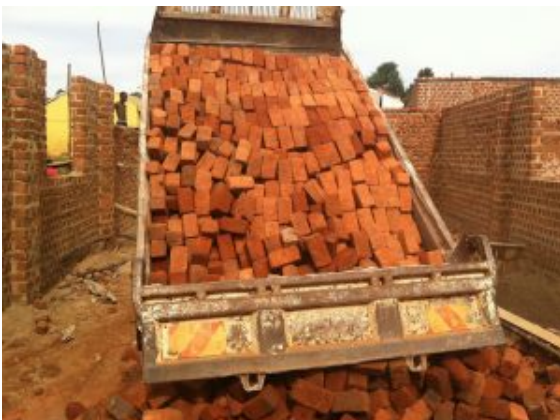
The delivery of bricks seemed to never cease—we praise the Lord for the