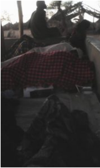
LEEPIING - QUARTERS - FOR - REV - EVECLIVE - AND - APOSTLE - DENIS - HEAVLY - GUARDED - THROUGH - THE - NIGHT BY MEN WITH BOWS AND ARROWS