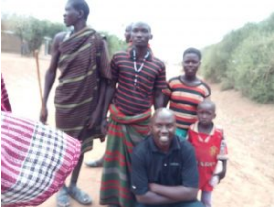
VILLAGERS - MEETING - THEM - DECEMBER - 4 - 2018