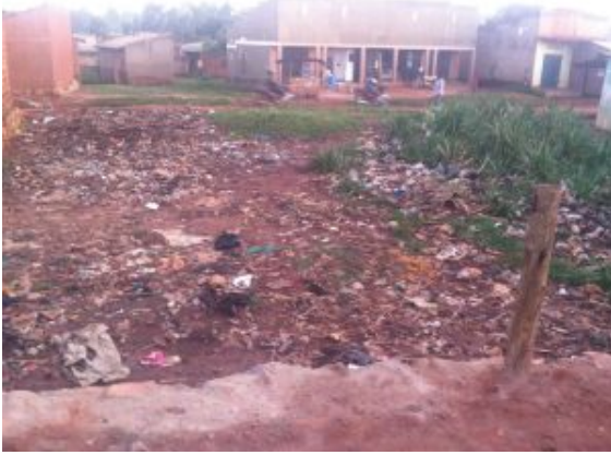
SEPTEMBER - 9 - 2017 - MILTON - SEES - THE - PLOT - PURCHASED - FOR - MAMA - CYNDIS - MILLING - PROJECT - WAS - A - GARBAGE - DUMP