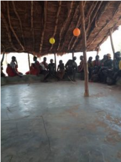
INSIDE - THE - CHURCH - IN - THE - VILLAGE - DECEMBER - 9 - 2018