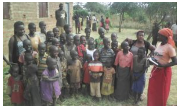
THE - LITTLE - CHILDREN - OUTSIDE - THE - NEWLY - BUILT - CHURCH .