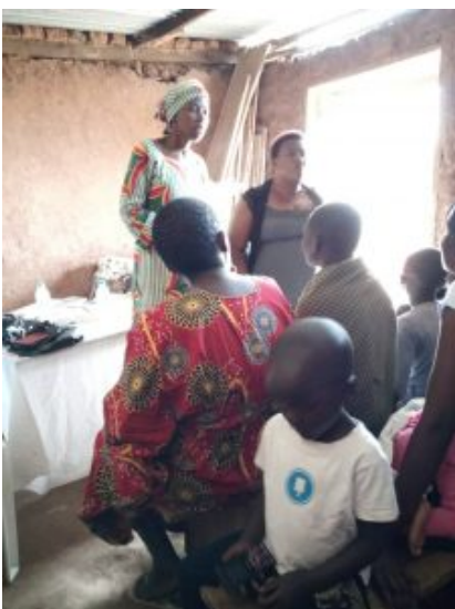
INTEPRETER - FOR - REV . -