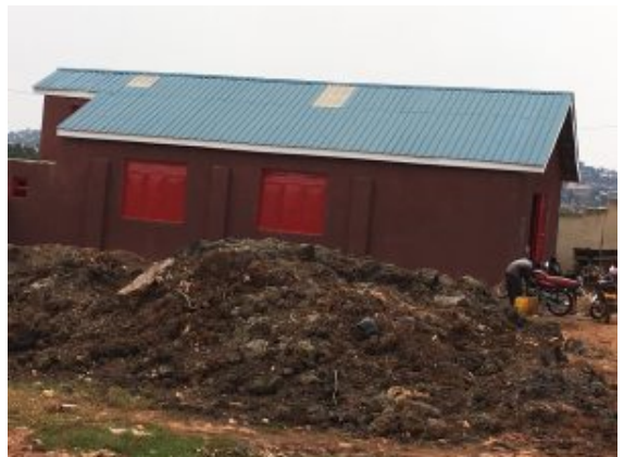
MILL - FULL - PROFILE - PHOTO -