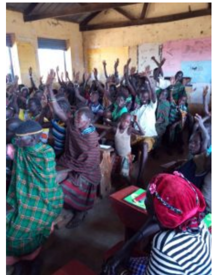
RAISING - THEIR - HANDS - FOR - JESUS - TO - BE - THEIR - LORD - AND - SAVIOR - DECEMBER - 2018 - DURING - THE - RAB - MISSIONS - IN - UGANDA .