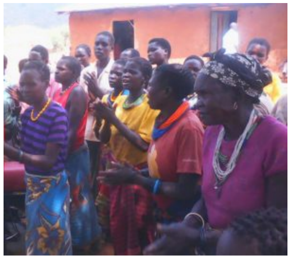
WOMEN - PRAISING - THE - LORD - OUTSIDE - DURING - THE - RABS - DECEMBER - UGANDA - MISSION