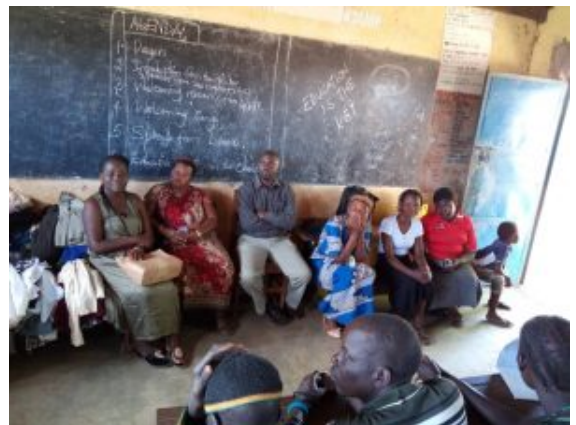
INSIDE - THE - SCHOOL .