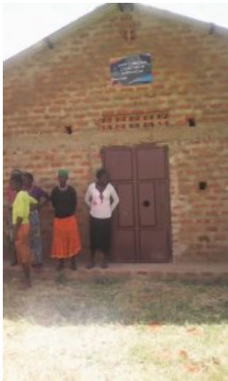
NEWLY-BUILT- CHURCH-BUILDING AT THE THIRD VILLAGE VISITED