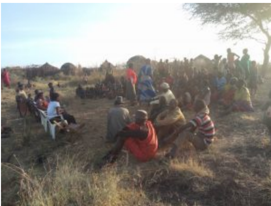
BEHIND - THE - VILLAGE - CHURCH - MEETING - OUTSIDE