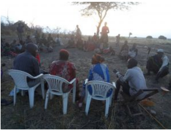
OUTSIDE - SERVICE - IN - A - CIRCLE - AT - ONE - OF - THE - VILLAGES