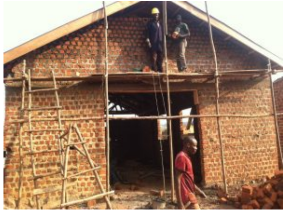
Final bricks being laid in the front façade and the roof is on—Glory to God!