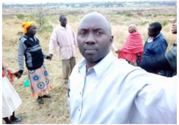
PRAYER - AND - FASTING - CONTINUES OUTSIDE THE VILLAGE