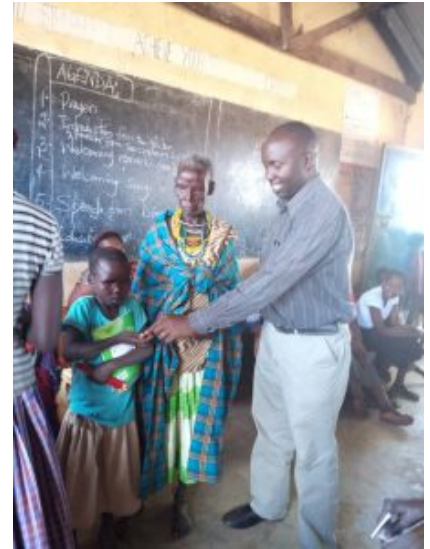
A - LITTLE - ONE - SHYLY - GETTING - A - SWEET - FROM - APOSTLE - DENIS