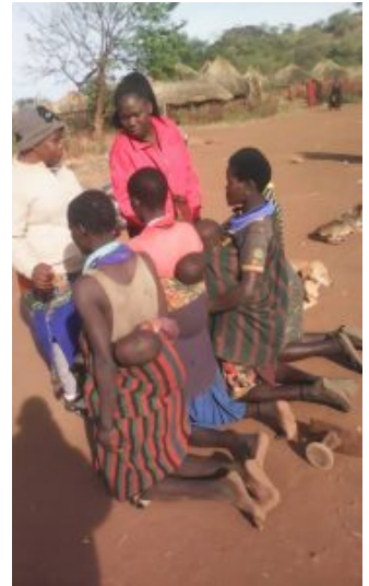
EW-MOMMIES-WITH- BABIES-STRAPPED- TO-THEM- RECEIVING-JESUS- AS-THEIR-LORD- AND-SAVIOR