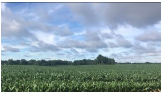
MICHIGAN CORN FIELD JULY 2, 2018

As you drive by the cornfields here in America, my hope through prayer is that you will remember those in desperate