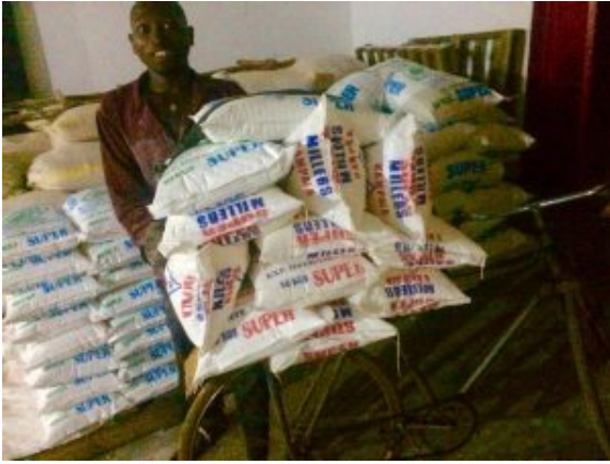
BICYCLE DELIVERY BOY WITH OUR BAGS OF FLOUR NOVEMBER 2018