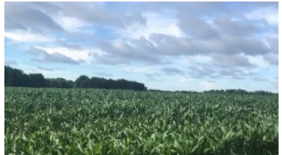
MICHIGAN CORN FIELD JULY 2, 2018