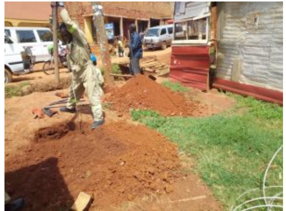
UMEME BURY POLES FOR PHASE 3 ELECTRICITY