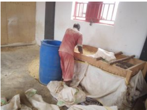
CLEANING CORN BEFORE IT GOES INTO THE HULLER