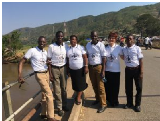
RAB INTERNATIONAL TEAM TANZANIA AND MALAWI AUGUST 2017