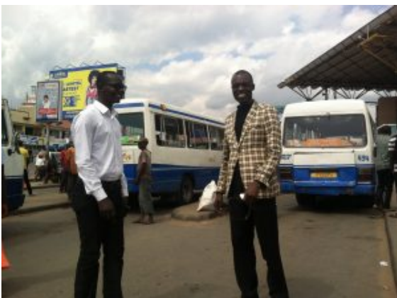
BURUNDI STREET WHEN PASTOR