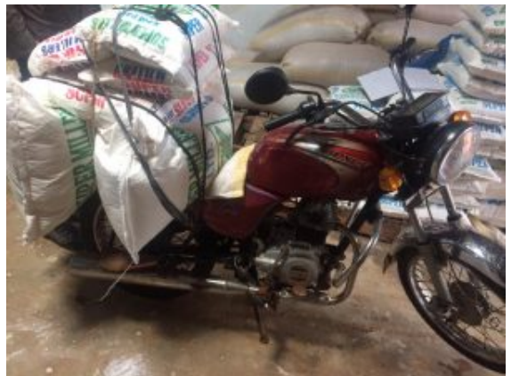
RABS MOTORCYCLE LOADED WITH BAGS OF FLOUR FOR DELIVERY