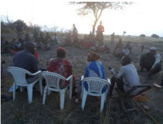
OUTSIDE - SERVICE - IN - A - CIRCLE - AT - ONE - OF - THE - VILLAGES