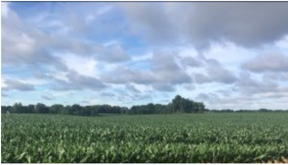
MICHIGAN CORN FIELD JULY 2, 2018

As you drive by the cornfields here in America, my hope through prayer is that you will remember those in desperate need of maize (corn) flour the daily dietary staple of the East African Nations! Just $10.00 USD equals 37,000 Ugandan Shillings and that buys a lot of flour for the average family. At MAMA CYNDI'S MILLING PROJECT we want to buy corn and mill it and through the ministry give the milled flour to the neediest in the Community. You can help us feed the most vulnerable of Kieraka Kasokoso (Kampala) Uganda, East Africa! Please let your ♥ lead you and make a tax deductible donation today! THANK YOU VERY MUCH AND GOD BLESS YOU AND YOUR FAMILY!