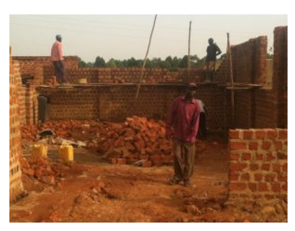
We thank the many local