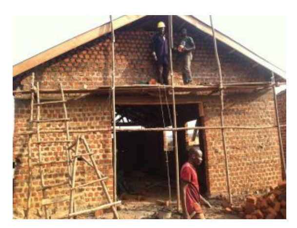
Final bricks being laid in the front façade and the roof is on—Glory to God!