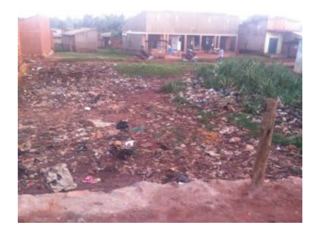
SEPTEMBER - 9 - 2017 - MILTON -SEES - THE - PLOT - PURCHASED -FOR - MAMA - CYNDIS - MILLING -PROJECT-WAS - A - GARBAGE - DUMP