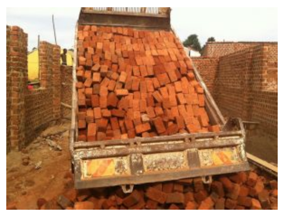
The delivery of bricks seemed to never cease—we praise the Lord for the funds and beautiful weather He gave us during construction.