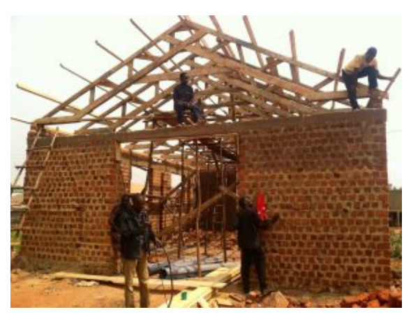
Roof rafters built on the site and lifted and raised into their position to hold the roofing

church volunteers and local workers who with God saw THE POSSIBLE that which others said was impossible. Glory to God