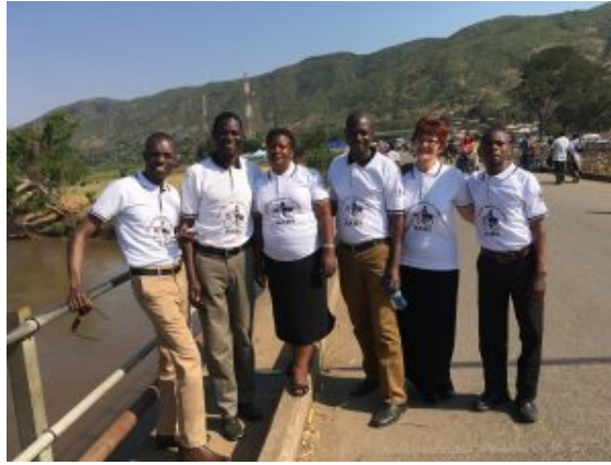
RAB INTERNATIONAL TEAM TANZANIA AND MALAWI AUGUST 2017