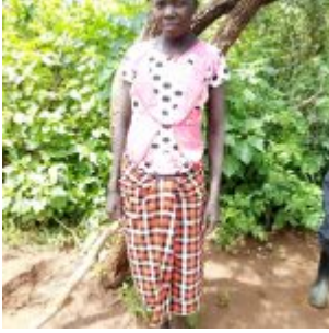
ONE OF OUR VOCATIONAL STUDENTS