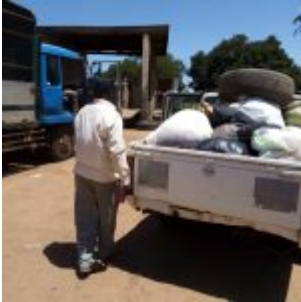
STARTED WITH PICKUP BUT LATER HAD TO BE ABANDONED DUE TO FLOODED RAODS