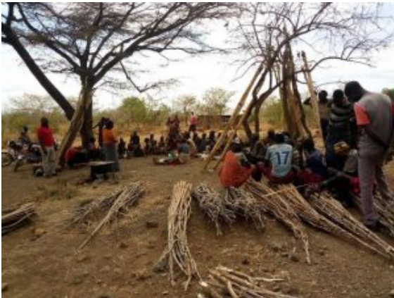
POLES - LEANED - AGAINST - THE - TREE - GATHER - BY - MUSASI - VILLAGERS - TO - BEGIN - CHURCH - AND - SCHOOL - STRUCTURE .