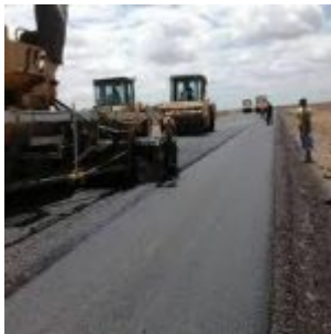
THE NEWLY CONSTRUCTED ROAD TO THE REFUGEE CAMP