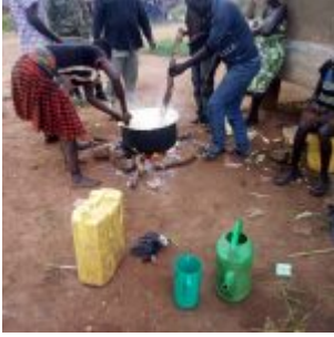
COOKING PORRIDGE FOR THE VILLAGERS AFTER FARMING