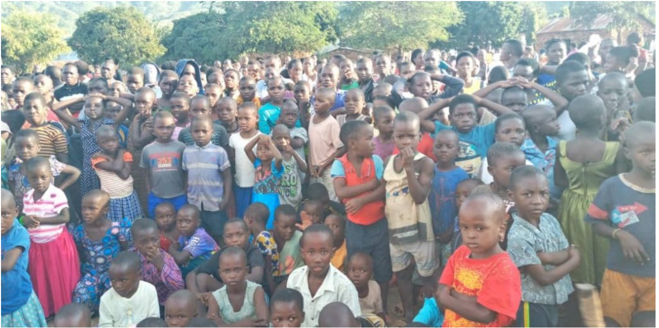
HUNDREDS OF CHILDREN CAME TO THE RABS CRUSADES