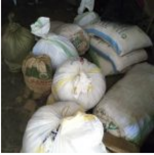
SUPPLIES FOR THE VILLAGES