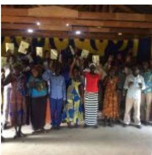
KAKUMA REFUGEE CAMP PASTORS AT RABS 3-DAY-CONFERENCE

Once these pastors were refreshed with the blessed Hope of Jesus in their lives, they readily learned how to go out and evangelize other fallen-away Christians (runaway brides) who themselves had wandered away from Jesus mostly because of the harsh reality of their very abnormal living conditions as refugees displaced from their own nations due to war, political unrest, and violence.