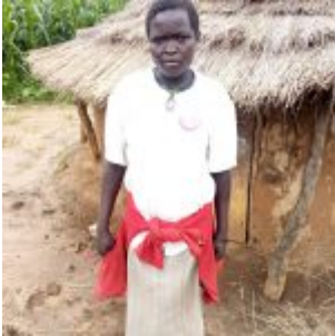
ONE OF OUR VOCATIONAL STUDENTS