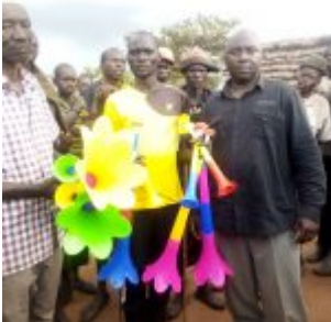
SPORTS HORNS TO BLOW WHEN ELEPHANTS INTRUDE