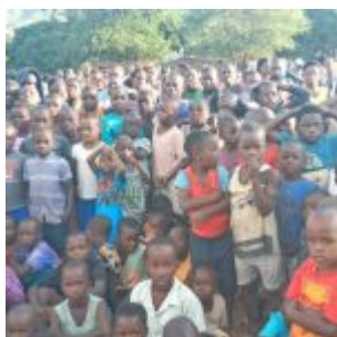
HUNDREDS OF CHILDREN CAME TO THE RABS CRUSADES