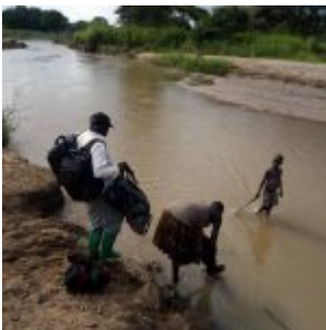
FLOODED ROADS TO THE VILLAGES FORCED WALKING AND CARRYING THE SUPPLIES