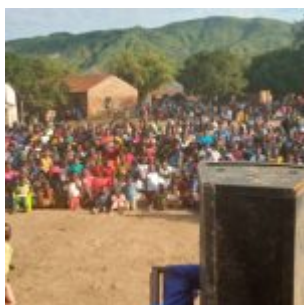
CRUSADE GROUNDS FULL OF PEOPLE