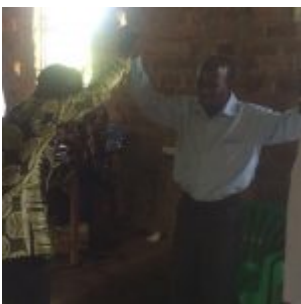
RECEIVING PERSONAL PRAYER AND REVELATION