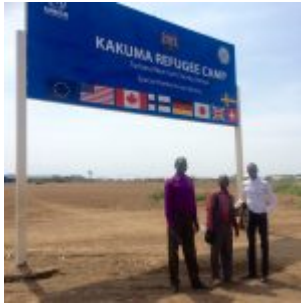
ENTRY INTO THE REFUGEE CAMP