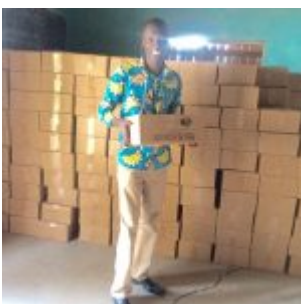
MISSIONARIES GAVE RABS BIBLES