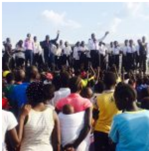
CRUSADE SALVATIONS AT THE REFUGEE CAMP