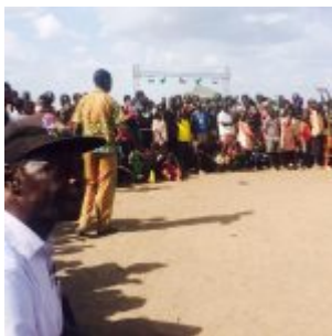
THOUSANDS ATTENDED THE EVENING CRUSADES