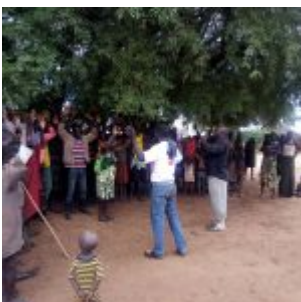
LEADING THE SALVATION PRAYER