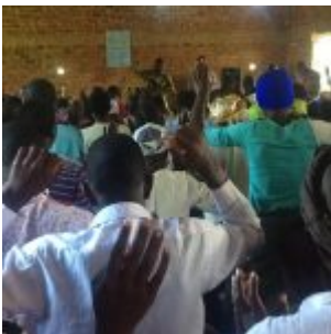
PRAYINIG TO OUR LORD