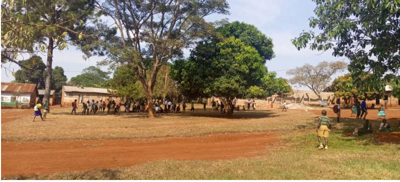
Edenset Primary & Nursery School Campus