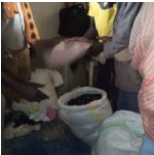
CLOTHES BROUGHT IN FOR THE VILLAGERS