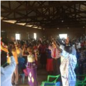
CORORATE PRAYER AVAILS MUCH FROM HEAVEN