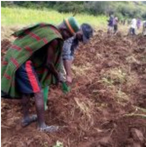
CAREFUL FARMING INSTRUCTIONS