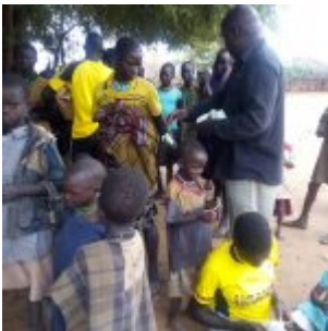
TIME TO TEACH THE CHILDREN