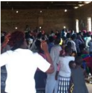
ONE CANNOT HELP BUT PRAISE THE LORD WHEN THE REVELATION OF HIM BEING THE BRIDEGROOM OF THE CHURCH SINKS INTO THE SOUL