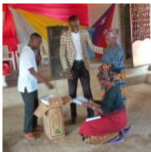
RABS LEADERS RECEIVING THE RABS BIBLE STUDY BOOKS

received for RABS a donation of Bibles from the Gideon organization that we later distributed to the new converts who gave their lives to Christ. Additionally, we also gave RABS Bible Study books to the conference pastors and church leaders.