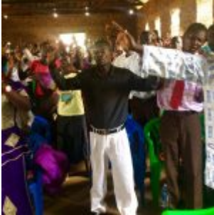
WHAT JOY WE HAVE IN JESUS