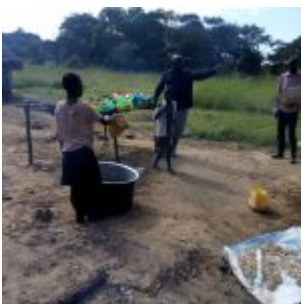
COOKING FOR THE STUDENTS